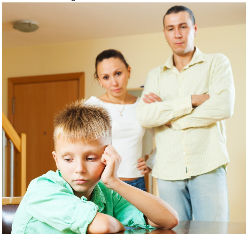
Figura 11: Pais bravos com o filho

Larry used to get good grades, but lately he's been spending more time with his friends and less time studying. Sometimes he copies his friend Joe's homework. Sometimes he just doesn't do his homework at all.