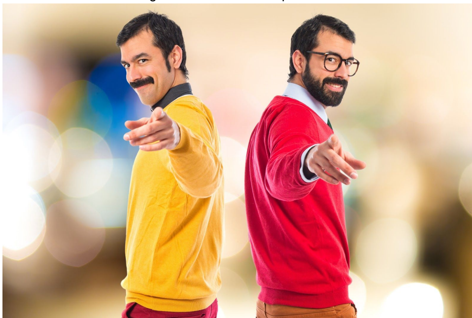
Figura 13: Dois irmãos apontando.

They decided to buy two used tow trucks and start a towing company. They painted the trucks blue and had gold lettering painted on the doors. They called the company Best Choice Towing. For the first several years, they drove the tow trucks themselves. Eventually, they bought more trucks and started leasing them to drivers. Soon the brothers were each earning over $100,000 a year.