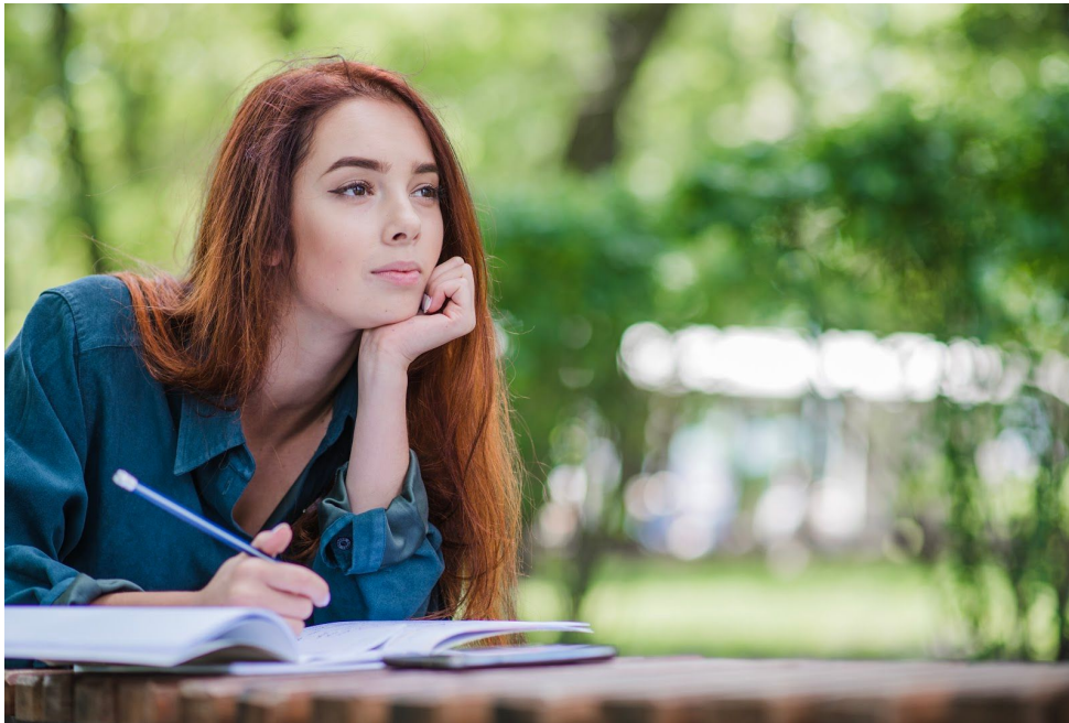
Figura 12: Mulher escrevendo pensativa

Juanita thought about her problem. She decided to write Julio a letter and tell him how she feels. Juanita's mother and friends think Juanita should talk to Julio in person or call him on the phone. They think it's wrong to break up with someone in a letter. What do you think? Is it okay to break up with someone in a letter?